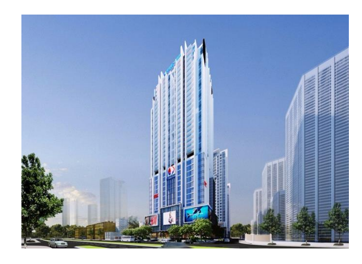
Hoang Huy Riverside Project